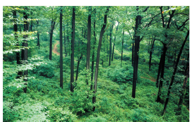
Van Cortlandt Park, The Bronx

New York City is home to some of the finest and most diverse forests in the region . A healthy forest includes trees, shrubs, and a vegetated understory. Wildflowers bloom on the forest floor in early spring, before trees and shrubs develop leaves.