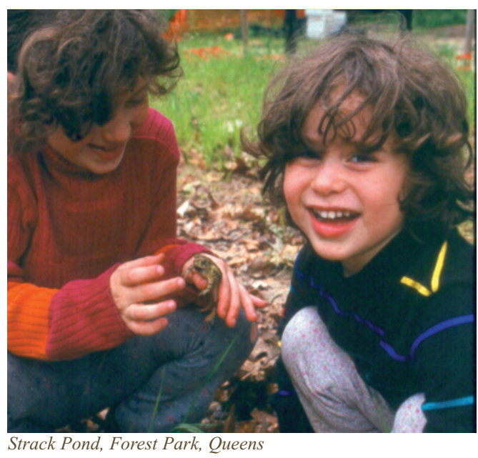
Strack Pond, Forest Park, Queens

That's right! You don't need to leave the City to get a taste of the wilderness—nature is all around you! So get on the subway or bus and explore New York City in a whole new way.