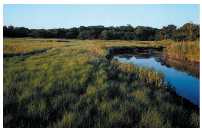
Udalls Park Preserve, Queens

Salt marshes are among the most biologically productive ecosystems on the planet . They provide shoreline areas with flood protection, serve as nursery grounds for fish and shellfish, and filter pollutants from coastal waters.