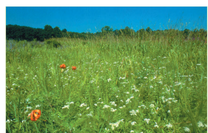
Pelham Bay Park, The Bronx

Meadows are sunny and open fields of grasses and wildflowers . Butterflies float over meadows while red-tailed hawks, kestrels, and barn owls hunt mice and voles. Unless meadows are maintained by fire or mowing, shrubs and trees will eventually take over and transform the area into a woodland.