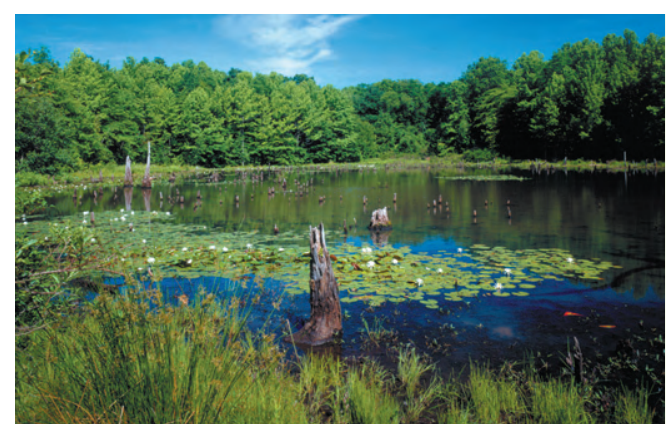
Blue Heron Park, Staten Island

Freshwater wetlands filter and clean our ground water , help stop erosion, absorb rain during heavy storms, and are home to frogs, salamanders, turtles, and dragonflies. Less than one percent of New York City's historical freshwater wetlands remain today.