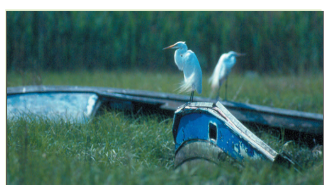
Great Egrets, Marine Park, Brooklyn

Reflecting remnants of their original ecosystems, Forever Wild Nature Preserves are important reservoirs of plant and animal biodiversity, including numerous rare, threatened, and endangered species. They provide a place for hiking, bird watching, dog walking (on leash), and environmental education. Natural areas also make a city healthier. Plants filter air and water, prevent flooding by absorbing storm water, and help keep the city cooler in the summer and warmer in the winter.