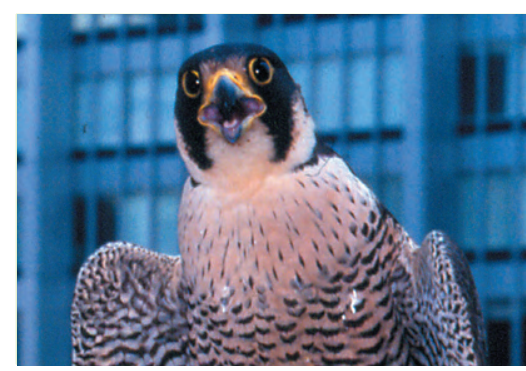
Peregrine Falcon, Wall St, Manhattan