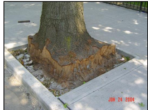
Figure 1 This tree was irreparably damaged because of the basal cutting and required immediate removal.

How does Parks appraise a tree that is destroyed?