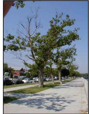
Figure 2: The branch and twig dieback was caused by root cutting years earlier when the sidewalk to the left of the tree was installed.

How does the loss of a branch or branches damage a tree?