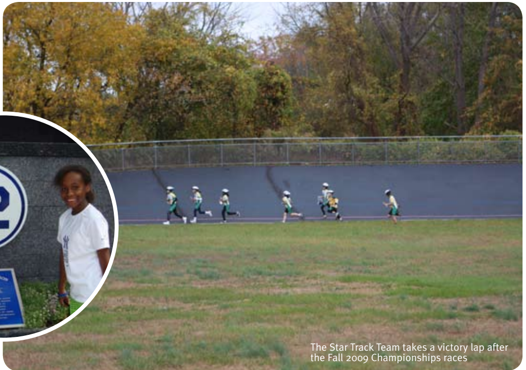
The Star Track Team takes a victory lap after the Fall 2009 Championships races