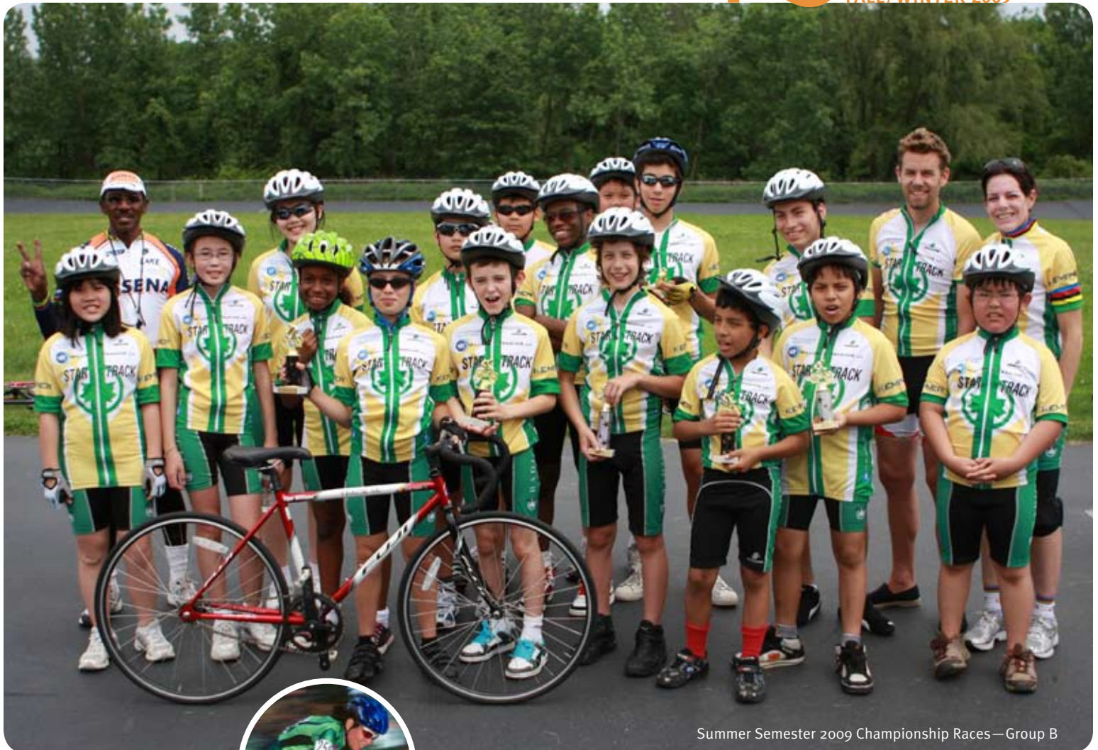
Summer Semester 2009 Championship Races—Group B